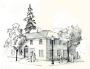
Walnut Avenue Women's Center